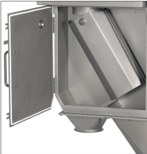
Separation unit with opened cleaning flap.

The RAPID 6000 metal separator primarily is used in industries with high hygienic demands.