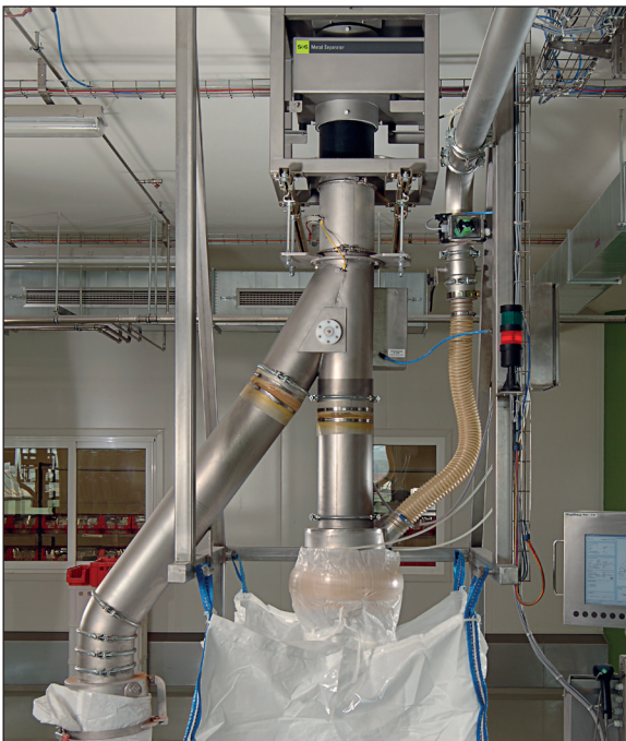
Installation example: IFS compliant metal detection directly before the filling of spice products into bigbags. (old version)