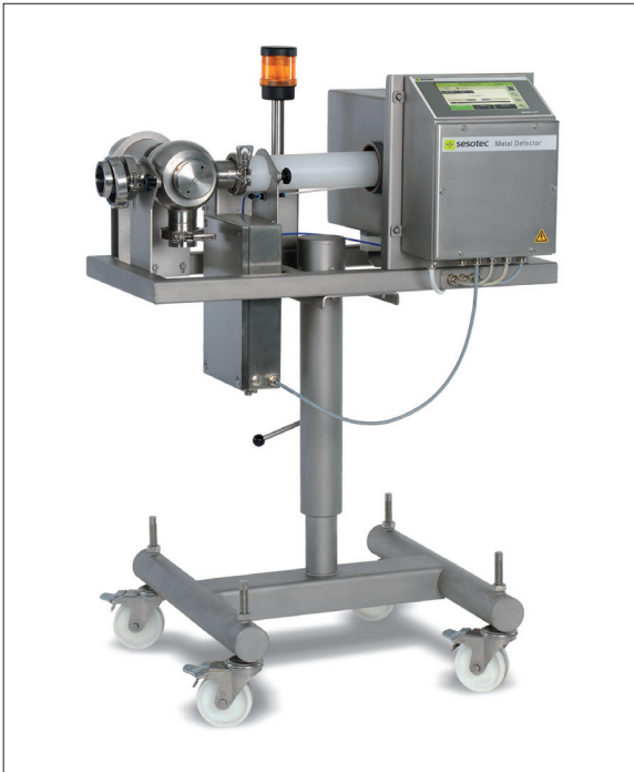
LIQUISCAN PL with height-adjustable stand