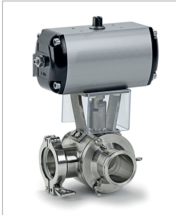
Separating system: Ball valve